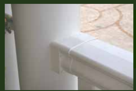
Illustration of 7000 Series mounting wedge set.

LIFETIME WARRANTY (LIMITED, NON-PRORATED)