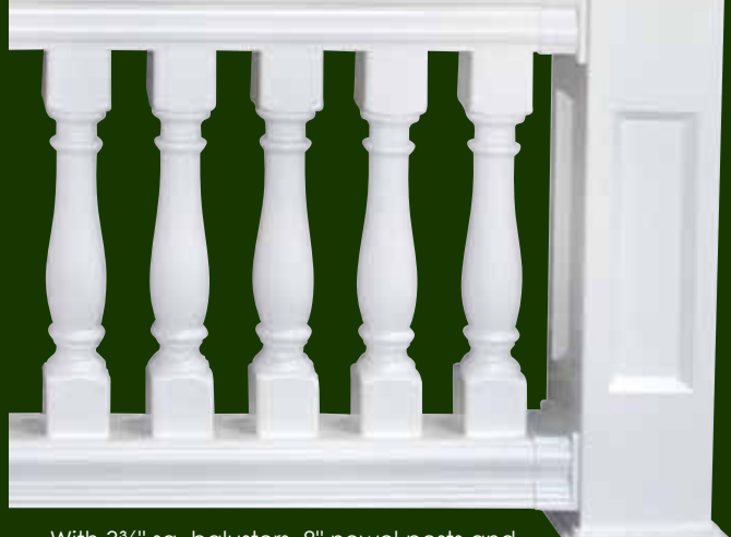
With 3%" sq. balusters, 8" newel posts and 6½" wide top and bottom rails, it is perfect for installations requiring larger railing systems.