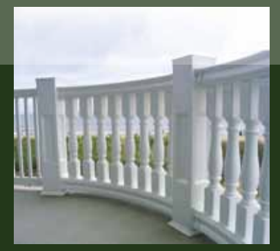
Curved sections are available in custom radiuses for a distinctive look.

These unique premium virgin vinyl Balustrade styles offer a bracketed system that is not only easy to install, but is strong and durable.